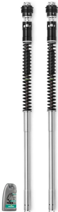
F20K fork kit