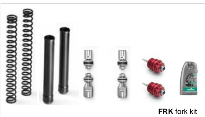
FRK fork kit