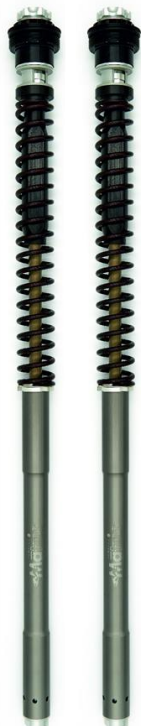
F20K Quad-valve asymmetric system