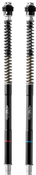
F25SA Sealed cartridge asymmetric system