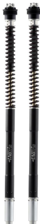
F25R Quad-valve asymmetric system